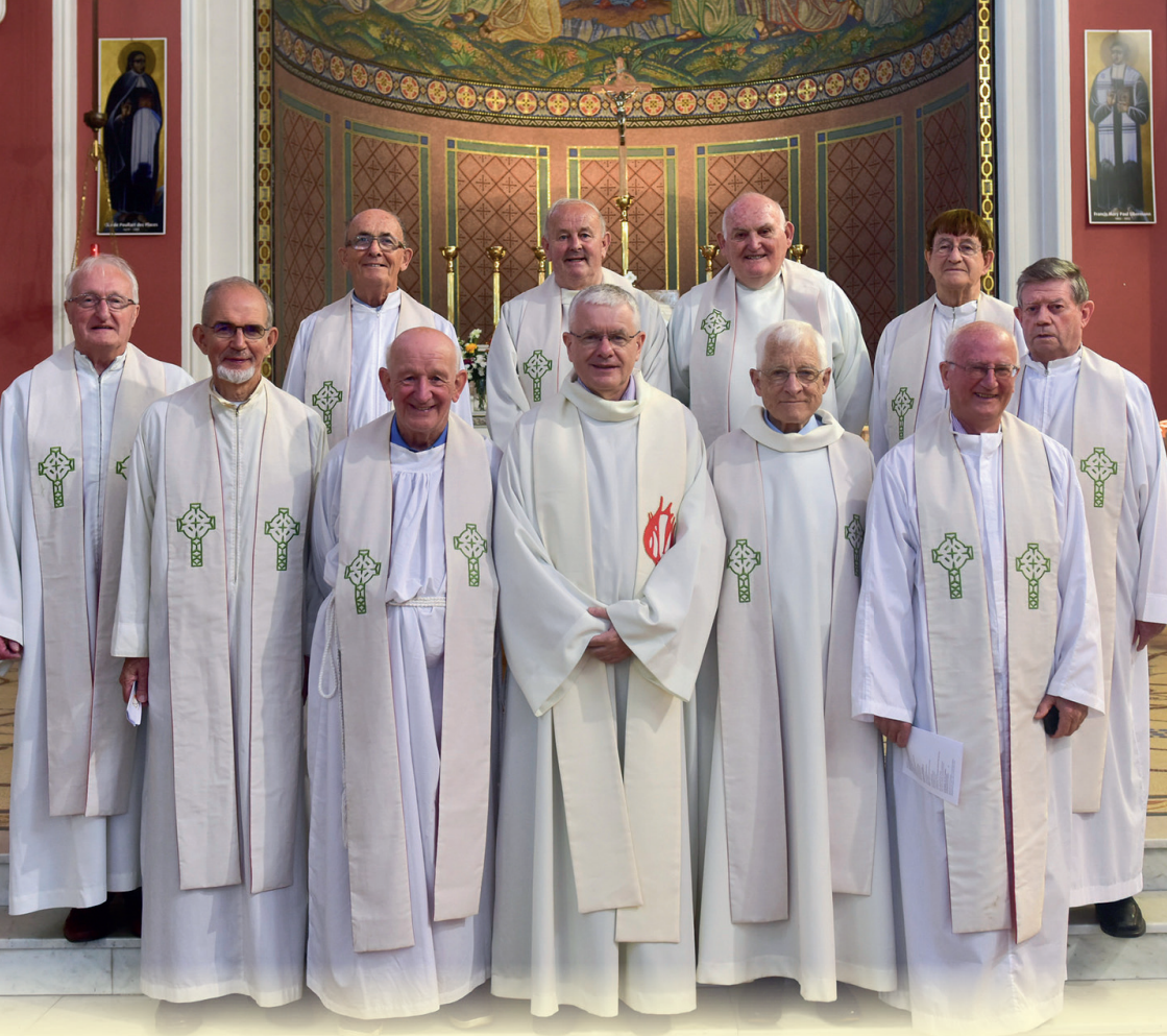
My Ordination group, 10th June 2018, in Kimmage, Dublin.