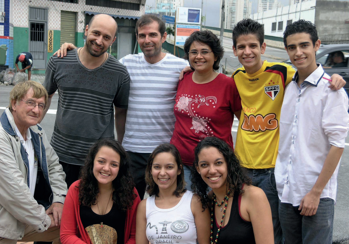
Above I am with a group from the coordination team for youth Leaderships Training Courses in São Paulo